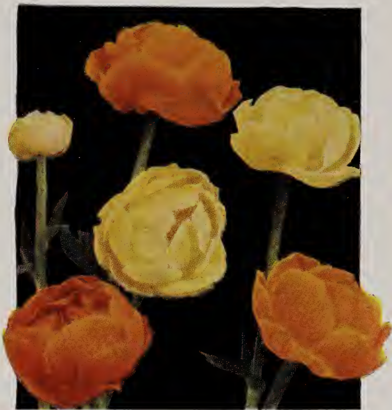
Trollius. New Hybrids. $1.00 each